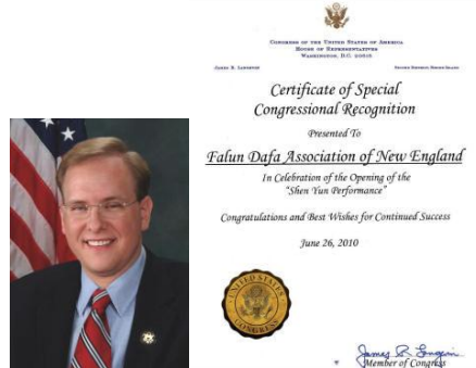
US Congressman James Langevin Issues Certificate of Special Congressional Recognition