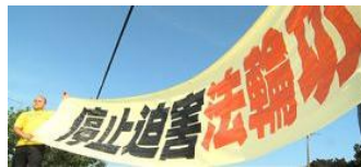
Banners along the highway

(Clearwisdom.net) Hu Jintao, the head of the Chinese Communist Party, arrived in Toronto on June 25 to attend the G20 and G8 Summits. At 5 p.m. that day, Hu's motorcade approached Toronto. Along the highway, Falun Gong practitioners held banners that read "Stop the persecution of Falun Gong."