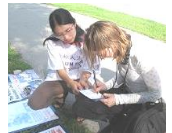
Student from Angola shows her support for Falun Gong

A student from Angola signed a petition calling on P.M. Stephen Harper to help stop the persecution in China. She said, "I don't remember how many years that every day I see Falun Gong practitioners holding peaceful protests in front of the Chinese Consulate. They just practice the exercises and have sitting meditation, very peaceful. Why persecute such a group of people for so long? It must stop."