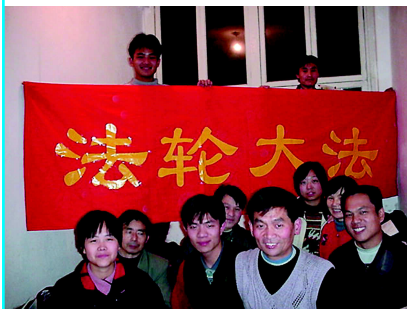
Smile for the journey ahead. This photo was taken before the practitioners went to Tian An Men Square in Beijing. Most of them were arrested afterward.