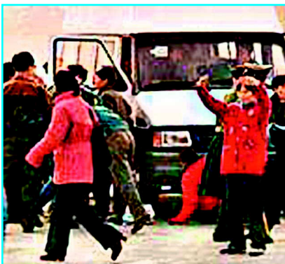
Calmly practicing amid arrests.