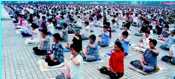
Over 10,000 people practicing Falun Gong during a sports festival in northern China in 1998.

In 1992, when Falun Gong was introduced to the public in China, it was well received. In both 1992 and 1993, Falun Gong was named the Star Qigong school and Master Li Hongzhi, the founder, was warmly supported by the Chinese authorities for significantly improving people's health and upgrading morality in society.