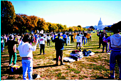
Washington DC, 1998

should always display compassion and kindness towards others and think of others before doing anything."